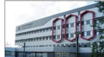
Clinical Centre of Vojvodina, Emergency Centre, Novi Sad, Serbia