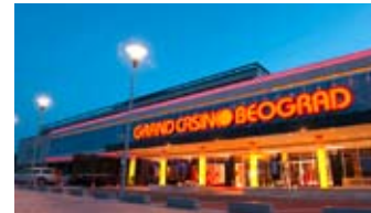
Grand Casino, Belgrade, Serbia