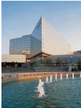
Hyatt Regency Hotel, Belgrade, Serbia