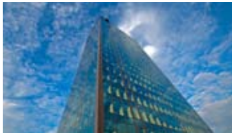
"Usce" Tower Business Centre, Belgrade, Serbia