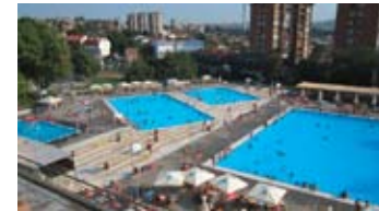
Sport Centre "Olimp" (swimming pools complex), Belgrade, Serbia