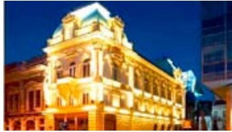
Aleksandar Palace Hotel, Belgrade, Serbia