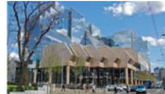
National Bank of Serbia, Belgrade, Serbia