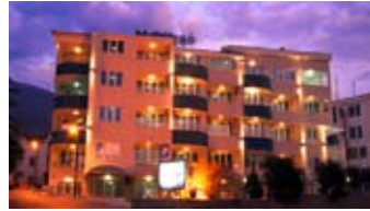
Bella Vista Hotel, Becici, Montenegro