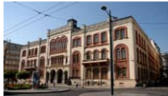
University of Belgrade, Captain Misa Anastasijevic Palace, Belgrade, Serbia