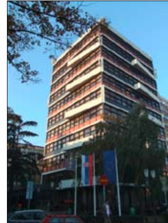
Municipality of Vracar, Belgrade, Serbia