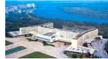
Palace Serbia (government building), Belgrade, Serbia