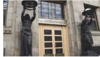
Central Bank of Bosnia and Herzegovina, Sarajevo, Bosnia and Herzegovina