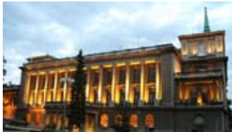
Office of President of Serbia, Belgrade, Serbia