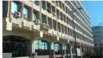
Ministry of Finance and Economy, Treasury, Belgrade, Serbia