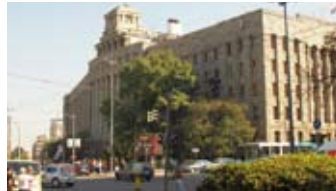
Serbian Post, more than 90 locations, Serbia